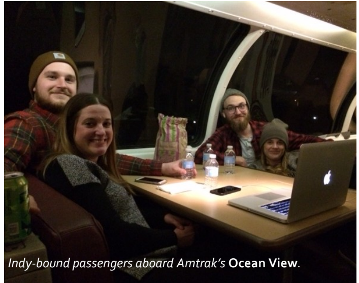
Indy-bound passengers aboard Amtrak's Ocean View.

Hoosiers have a rare opportunity in March to see the Indiana countryside aboard Amtrak's only dome car. The car is affectionately known as "Ocean View." As the unidentified passengers pictured above learned, the rail car features an upper level with windows on all sides.