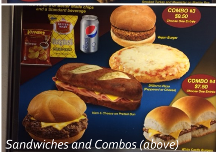
Sandwiches and Combos (above)

On board, "for purchase" food options are divided into four categories – breakfast specialties, healthy options, snacks, and combos & sandwiches. You're encouraged to peruse the café menu (above) and photos at left for your favorite sandwich or snack.