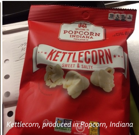
Kettlecorn, produced in Popcorn, Indiana