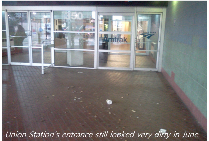
Union Station's entrance still looked very dirty in June.