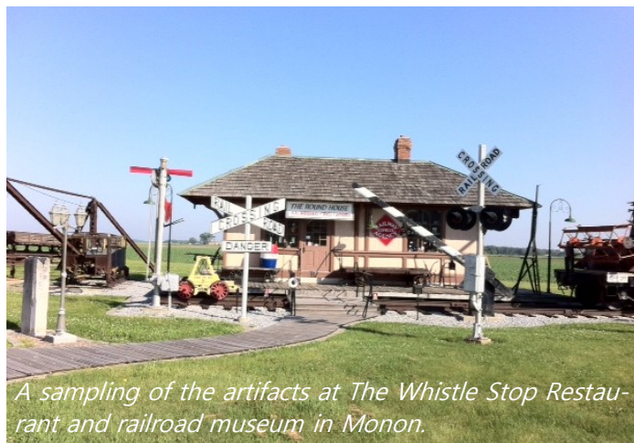
A sampling of the artifacts at The Whistle Stop Restaurant and railroad museum in Monon.