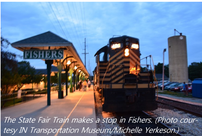
The State Fair Train makes a stop in Fishers.

The Fishers station location for this year's Fair Train has moved to a temporary tent location just south of the Fishers Library, close to the original train station. Construction around the Municipal Plaza area in Fishers precipitated the move to the temporary location. Parking in the Municipal Plaza is still available during construction. Watch for directional signs to help you find the best parking spot. More information can be found at itm.org .