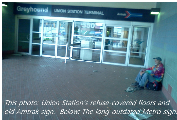
This photo: Union Station's refuse-covered floors and old Amtrak sign. Below: The long-outdated Metro sign.

A consultant report being done by the City of Indianapolis on needed repairs to the station—which was due out in February—is still pending. However, our representatives pointed out that no such report is needed to clean the bathrooms more frequently or prohibit