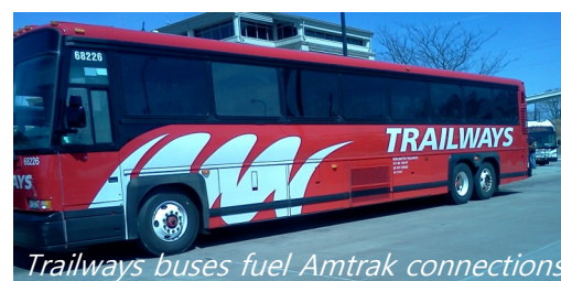
Trailways buses fuel Amtrak connections

The 12:50 p.m. from Indianapolis goes to (continued) ("Amtrak