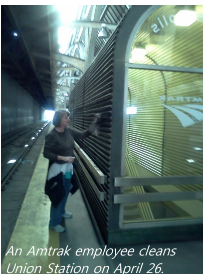
An Amtrak employee cleans Union Station on April 26.

Amtrak staff in Beech Grove reports the facility not only repairs Amtrak cars from around the na-