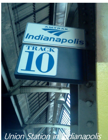
Union Station in Indianapolis

In March, IPRA representatives spoke with the City of Indianapolis (which owns the Union Station) and Browning Investments (which manages Union Station) to urge better maintenance of the beleaguered facility (see pictures).